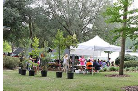
Arbor Day Celebration, Lake Lily Park, 2015