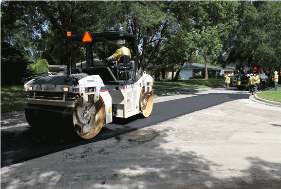
The repaving of Willa Vista Trail at Nottoway Trail on a recent August morning. Can't see the animated gif? Click here.