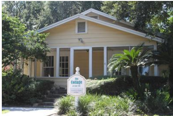
The Cottage at Lake Lily is pictured above.

The Parkside Chats series provides residents opportunities to ask questions and dialogue with a member of the City Council in a small group setting. Each session is held at the Maitland Community Park on the first Wednesday of most months from 8:00 - 9:00 a.m. Coffee will be provided.