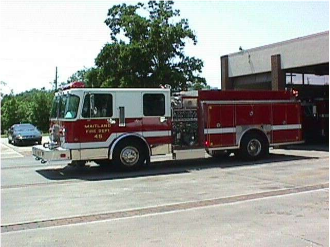
City of Maitland Fire Station located within the City's municipal complex.