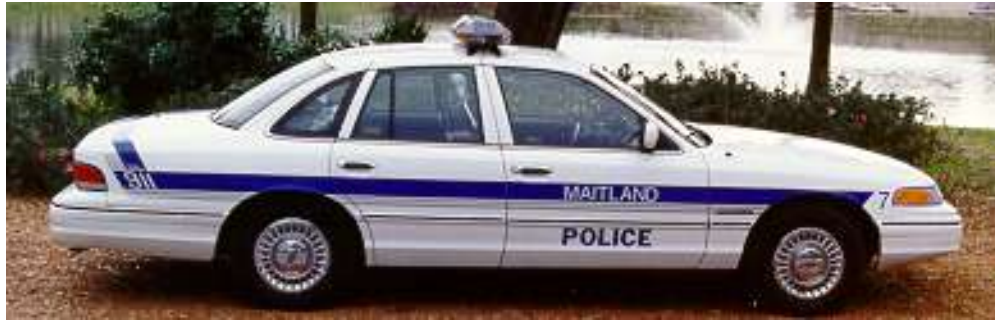
Fleet Vehicle – City of Maitland Police Department.